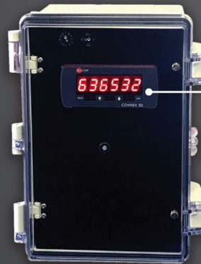
digital display module (CDDM)

The CONNEX 3D™ is a revolutionary concept in the process instrumentation market. It is flexible, versatile and adaptable due to the variety of modules that connect to each other. Think of the modules like Legos®, pick and choose from a wide variety of options that plug into your CONNEX 3D to create a unique system to fit your exact needs.